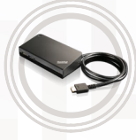
ThinkPad USB 3.0 Pro Dock