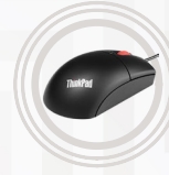
ThinkPad USB Travel Mouse