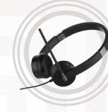
Lenovo Stereo 3.5 mm Headset