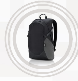
ThinkPad Active Backpack