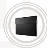
ThinkPad X1 Ultra Sleeve