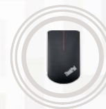
ThinkPad X1 Wireless Touch Mouse