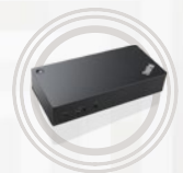
ThinkPad Thunderbolt 3 Dock