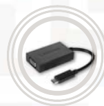
Lenovo USB-C to VGA Adapter