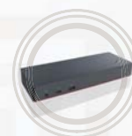
ThinkPad ThunderBolt 3 Dock