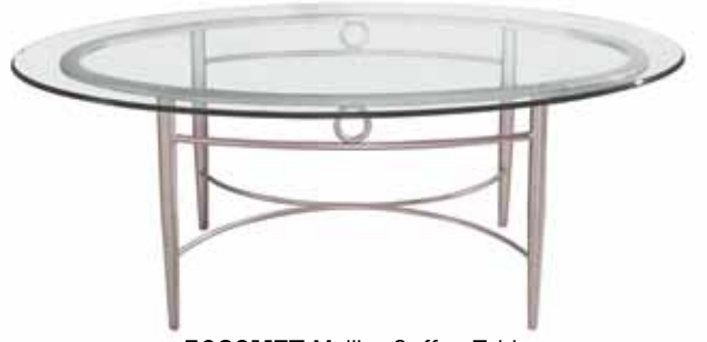
5920MET Malibu Coffee Table