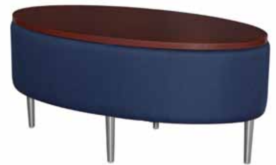
5822 Oval Table without Spacers Forte 298-004 Cadet WC Windsor Cherry