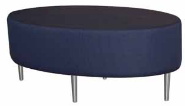
5826 Oval Table, Fully Upholstered Forte 298-004 Cadet