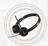
Lenovo Stereo Headset