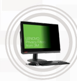
Lenovo Privacy Filter for ThinkCentre AIO from 3M