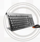
Lenovo Professional Wireless Combo