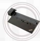
ThinkPad Pro Dock