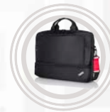
ThinkPad Essential Topload