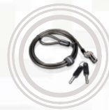
Microsaver DS Cable Lock