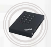
ThinkPad USB 3.0 Secure Hard Drive