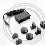
Lenovo 65W Travel AC Adapter