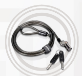
Microsaver DS Cable Lock