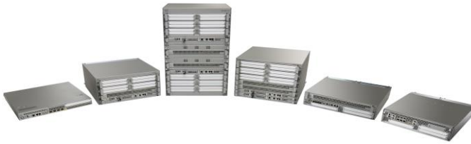
Figure 2. Cisco ASR 1001-X Router