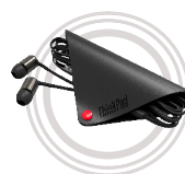
ThinkPad® X1 In Ear Headphones

Superior sound quality with a comfortable fit