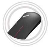
ThinkPad® X1 Wireless Touch Mouse

Wirelessly connect and expand the function of your device