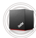
ThinkPad® WiGig Dock

Superior sound quality with a comfortable fit