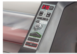
Easy to Use Control Panel