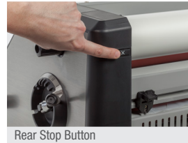
Rear Stop Button