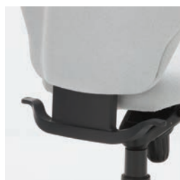
Patented lumbar support