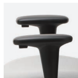
Optional RPA arm (height, width and pivoting arms)