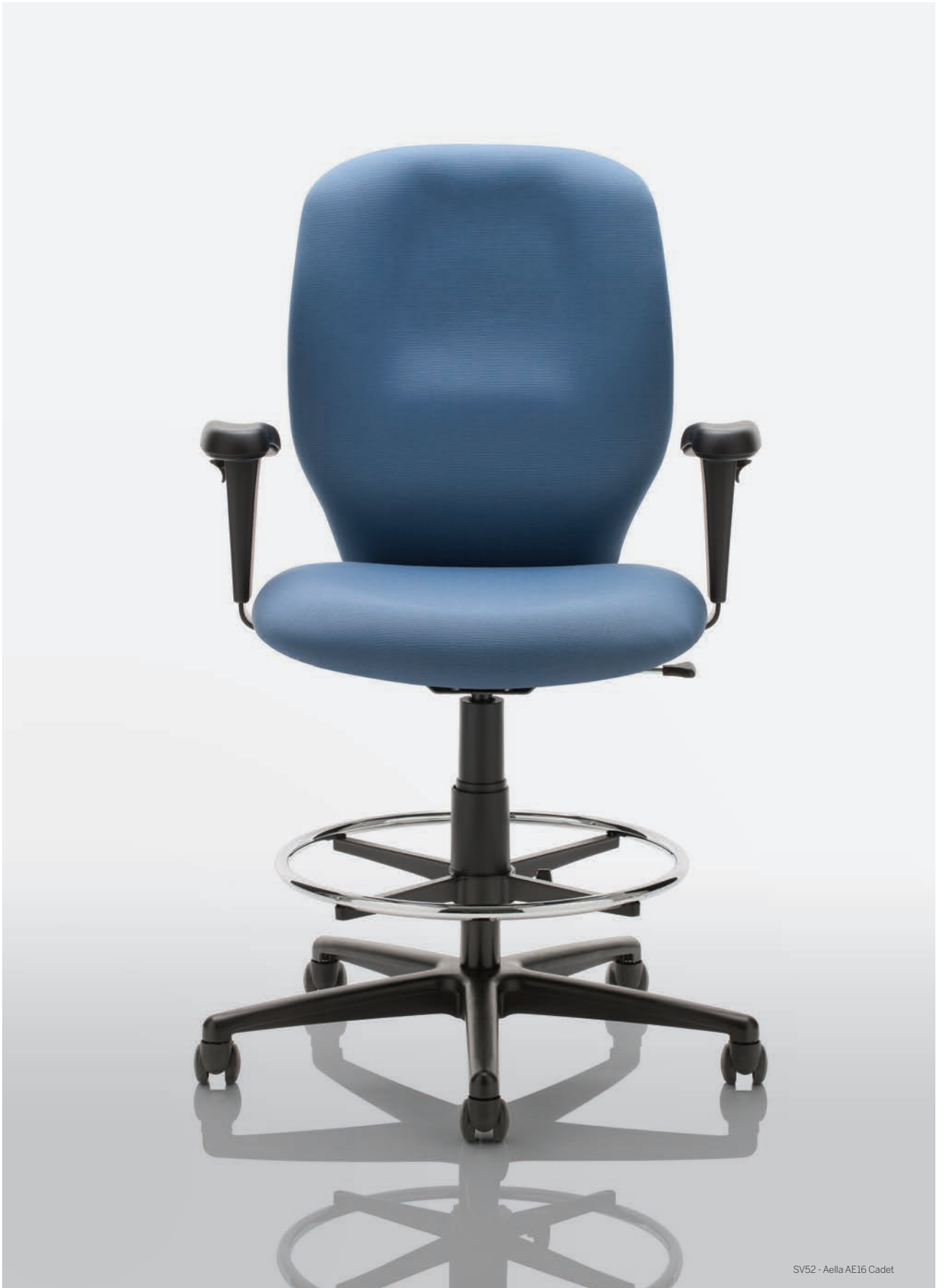
SV52 - Aella AE16 Cadet

Included, as well, are stools for drafting and design applications in labs and studios. Design emphasis has been placed on performance. A plush seat cushion cradles the user while intuitive ergonomics deliver all the expected adjustments and adapt to each user very easily.