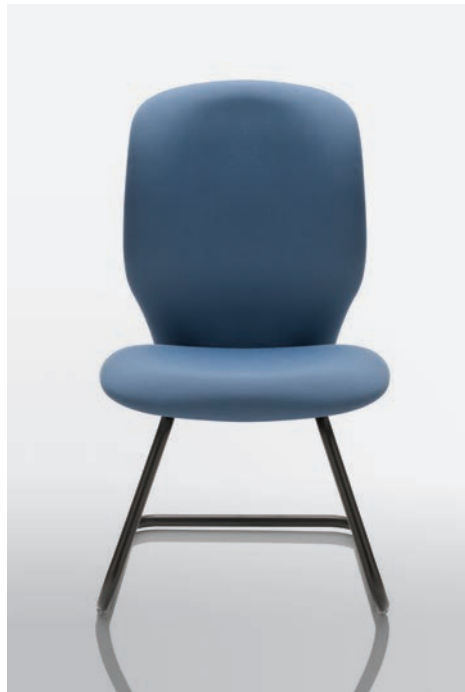
SV31 - Aella AE16 Cadet