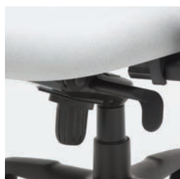
5-position tilt lock with forward seat pitch adjustment (on 24-hour knee-tilt control models)