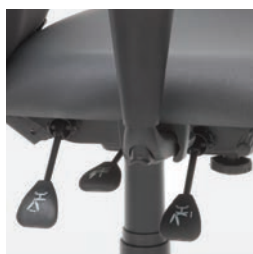
High performance, multifunction mechanism