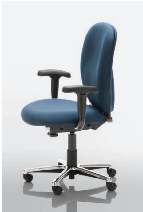
SVX11 - Aella AE08 Night Sky

A best seller, Savvy offers an impressive range of models for nearly any office application: executive, management, task, conference room, break rooms and lobby.