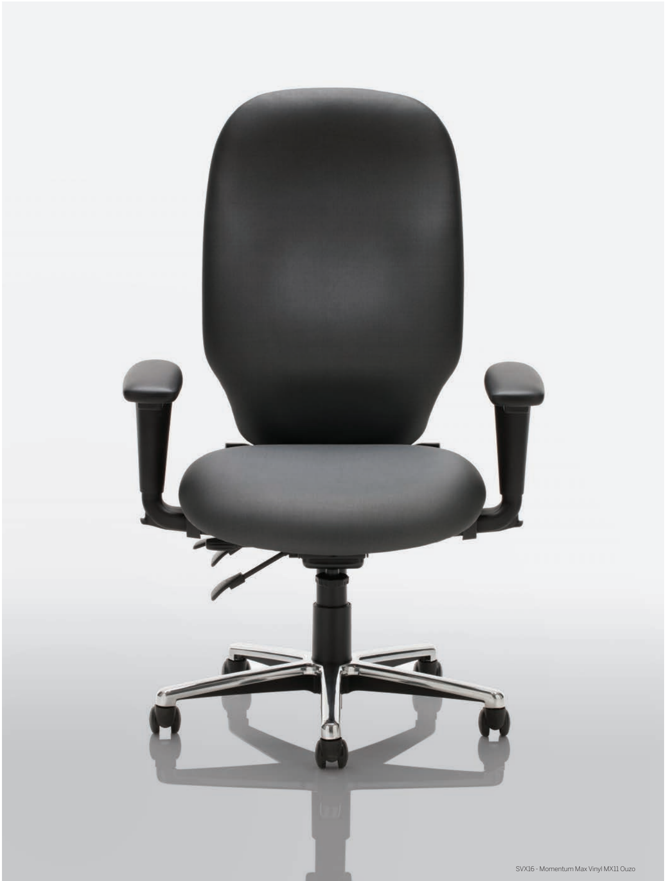
SVX16 - Momentum Max Vinyl MX11 Ouzo

Savvy features a patented internal lumbar support system that offers a choice of 5 different positions without leaving your seat. 24-hour rated models have been designed specifically for multi-shift operation. The elegance of Savvy is its extraordinary value and ability to adapt to any office design.