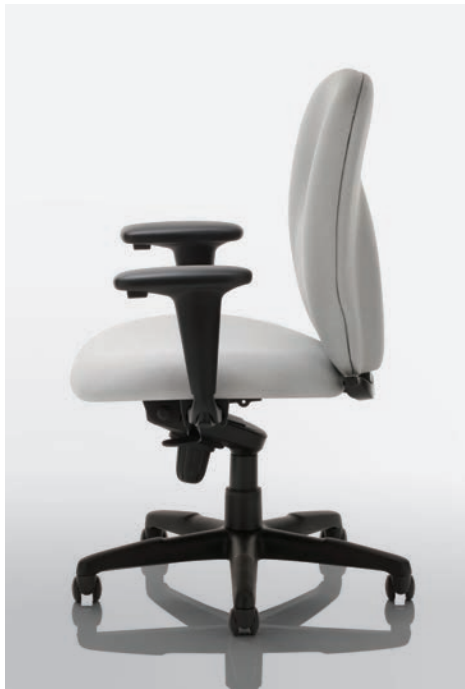
SV24 - Maharam Messenger MG046 Ice