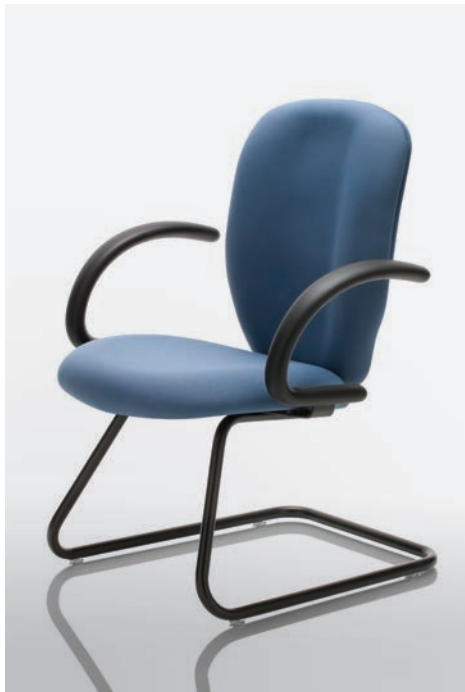
SV32 - Aella AE16 Cadet