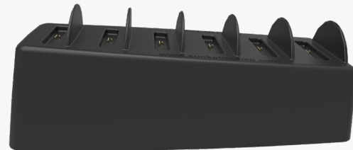
6 Multi-Bay Charging Dock

Connect your DuraCase to either one of the GDS® Charging Docks or Charging Adapter. The exterior docking contacts are specifically engineered for secure docking and charging of both devices in the DuraCase. The charging docks are designed to withstand repeated docking and undocking. Embedded magnets position the DuraCase and hold the docking station in place. Efficient for charging one or many devices.