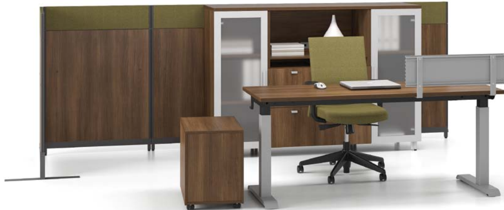
Height adjustable table from QUORUM MULTICONFERENCE, PanGram divider panels and Concept 3 storage unit. Hazelnut finish. Saggio seating by United Chair.

The bases of our height adjustable tables come in two accent colors, Silver and Anthracite Grey. Both aesthetic and functional, these tables have no horizontal crossbar between the bases, allowing full clearance for knees and also creating more space for mobile pedestals for storage.