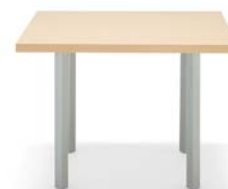
T5NN-SQ36 GIN + TNNS-QLT2