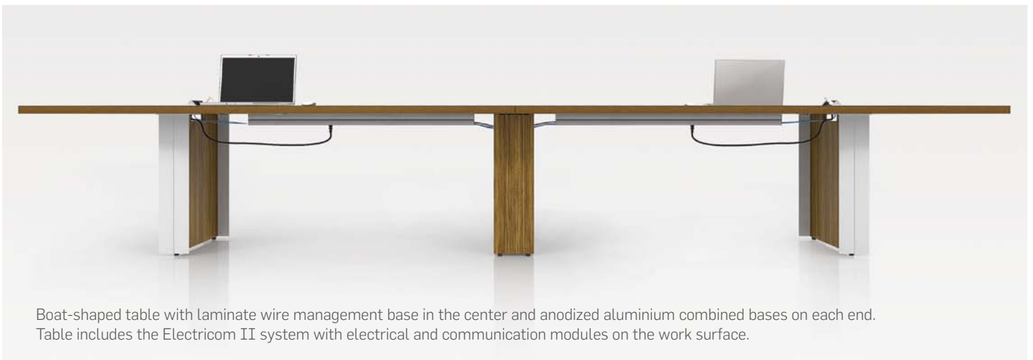
Boat-shaped table with laminate wire management base in the center and anodized aluminium combined bases on each end. Table includes the Electricom II system with electrical and communication modules on the work surface.