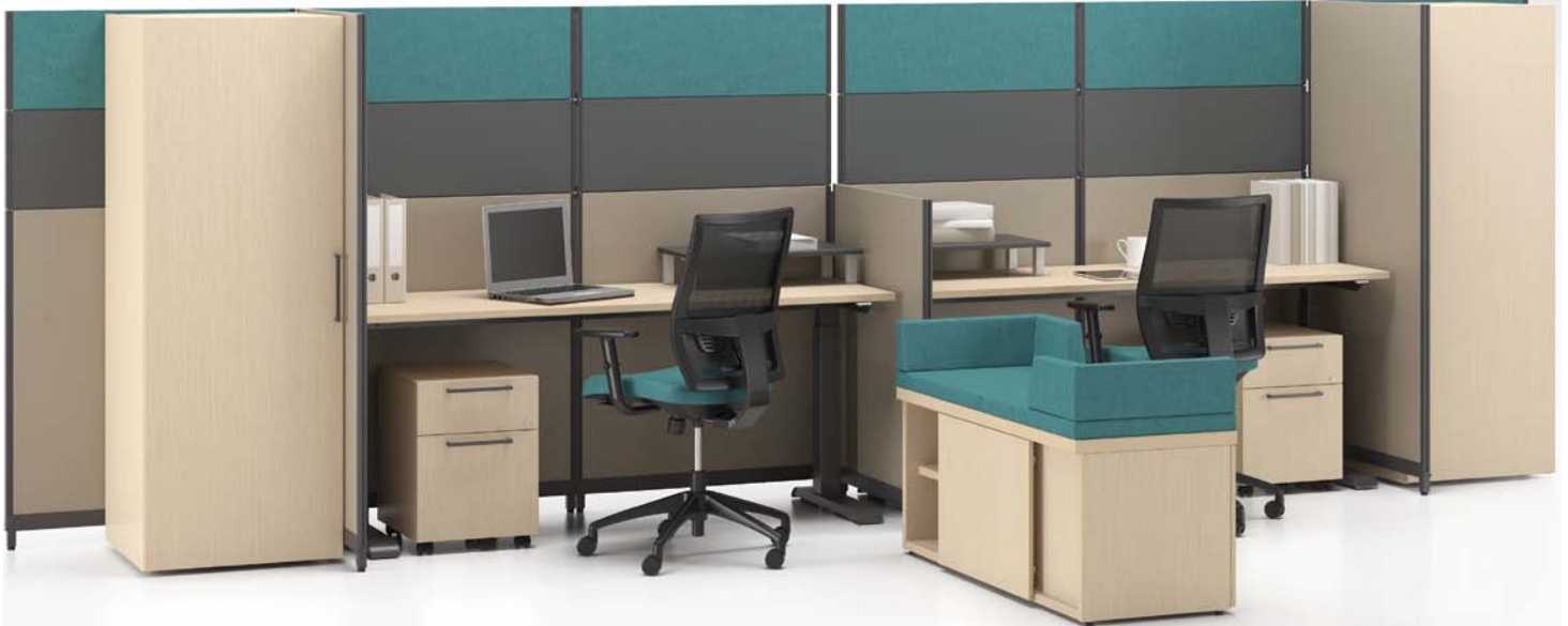
Height adjustable tables from QUORUM MULTICONFERENCE, PanGram divider panels, storage furniture from the PanGram and C.I.T.É. collections, together in a combination of Ginger and Clay finishes. Affinity seating by United Chair.

In addition to blending in seamlessly with all Groupe Lacasse collections, the height adjustable tables are perfectly adapted to multitasking. Create functional and ergonomic work stations in an instant. Guaranteed efficiency!