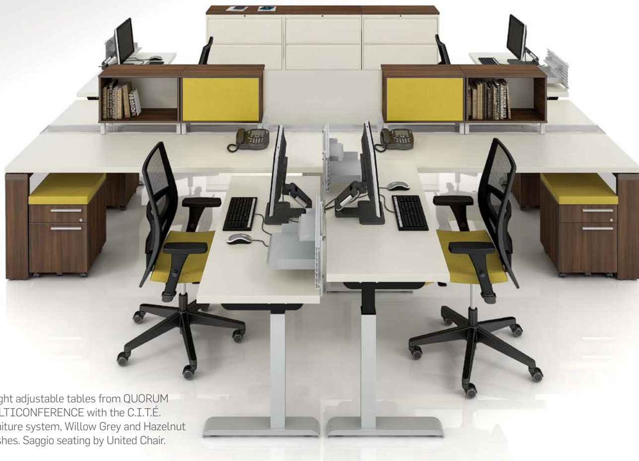
Height adjustable tables from QUORUM MULTICONFERENCE with the C.I.T.É. furniture system, Willow Grey and Hazelnut finishes. Saggio seating by United Chair.