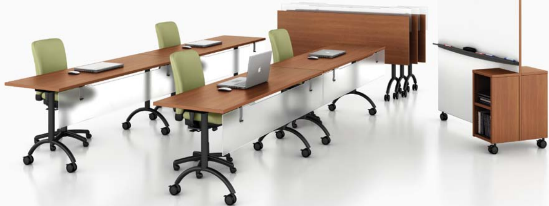
Marker boards and training tables with translucent modesty panels from QUORUM MULTICONFERENCE, Bourbon Cherry finish. Onyx seating by United Chair.