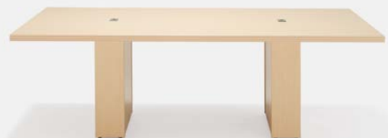
T51S-RC3684G2 GIN + TNNN-LB20WM GIN