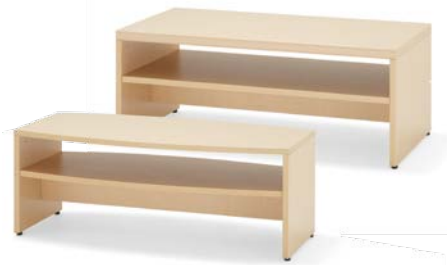
T1NN-STB244818 GIN T52N-ST244818 GIN