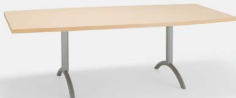
T5NN-W3684 GIN + TNNS-TB26