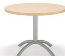
T5NN-R36 GIN + TNNS-XB33

Conference tables and small round tables from QUORUM MULTICONFERENCE, dividing panels from PanGram and storage units from Concept 400E, Natural Maple finish. Affinity seating by United Chair.