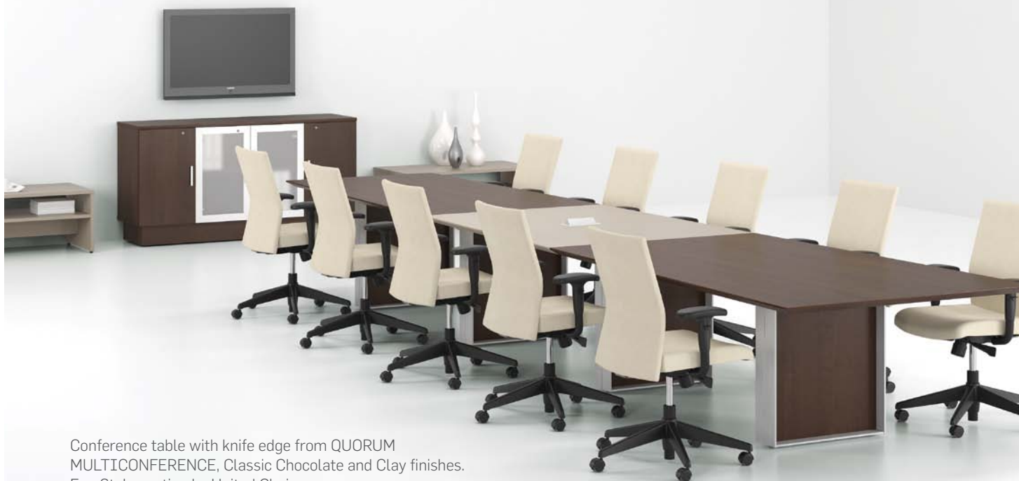
Conference table with knife edge from QUORUM MULTICONFERENCE, Classic Chocolate and Clay finishes. FreeStyle seating by United Chair.

QUORUM MULTICONFERENCE: Where everything fits together > This is where you brainstorm, this is where you decide! Your conference rooms must be open for discussions. The outcome of a modern vision of what furniture should be, the QUORUM MULTICONFERENCE collection redefines the word "versatility". Our conference tables are completely adaptable to new office technologies and are available in a wide variety of finishes, sizes and shapes. It is now up to you to unlock their potential!