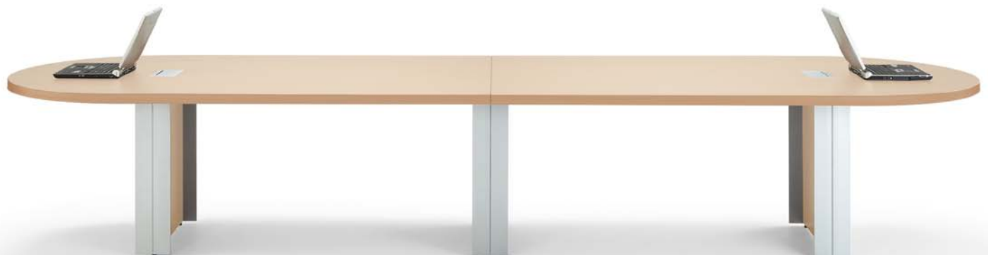
T52N-RC48108P2 GIN + TNNN-CB24