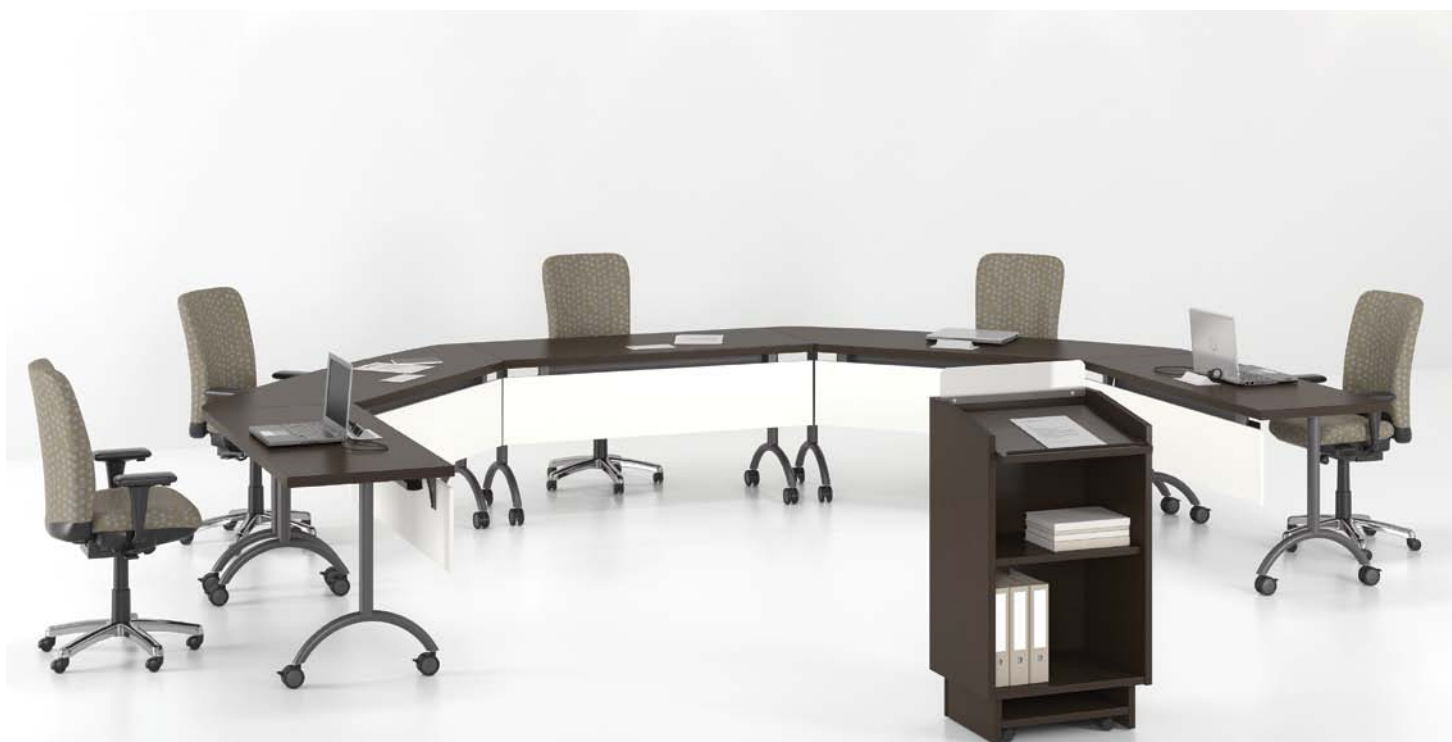
Lectern, modular table with modesty panel from QUORUM MULTICONFERENCE, Dark Chocolate and Snow finishes. Onyx seating by United Chair.

Contemporary style. Different configurations and shapes, wide array of bases and legs, electrical/wiring management modules. Fixed or mobile, our modular tables are versatile and flexible. It is up to you to uncover their full potential! Today's conference room, tomorrow's training room.