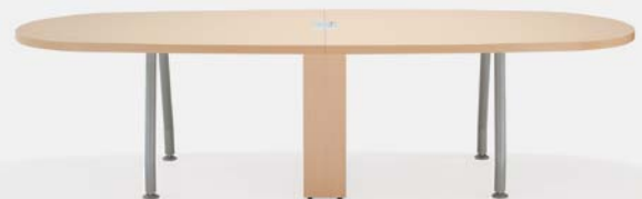
T5NN-O48108PC GIN + TNNN-LB24WM GIN + TNNS-STL2