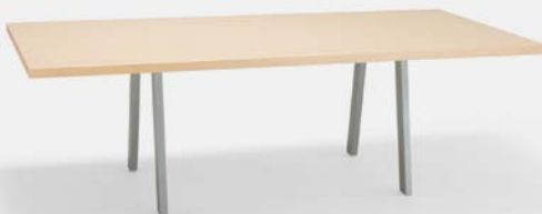
T5NS-RC3684 GIN + TNNS-ATL2