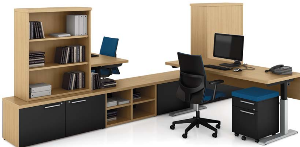
Height adjustable tables from QUORUM MULTICONFERENCE, storage furniture from C.I.T.É. and open hutches from Morpheo, Tuscany Walnut and Crystal Black finishes. Saggio seating by United Chair.