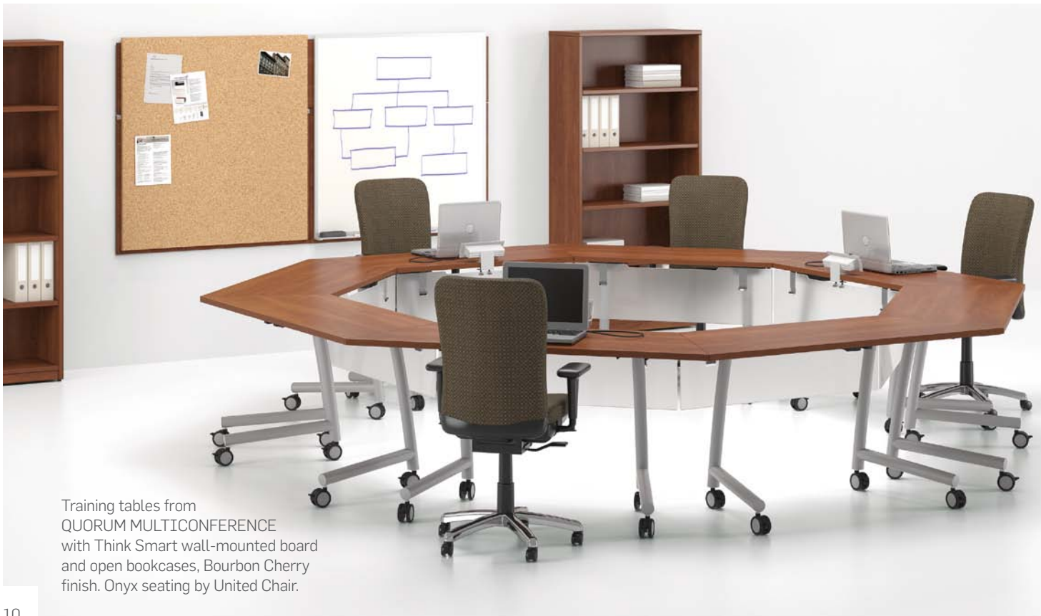
Training tables from QUORUM MULTICONFERENCE with Think Smart wall-mounted board and open bookcases, Bourbon Cherry finish. Onyx seating by United Chair.

An alliance of style and efficiency, our mobile training tables available in a variety of shapes give you the freedom of reconfiguring your workspace in record time. It's the perfect solution for classrooms and meeting rooms requiring constant adjustments. Light and easy to move, these tables come with or without translucent modesty panels. They can also be fitted with a Flip-Top mechanism, making it effortless to fold the top down. Class is out? Then you can simply nest the tables together, move them and store them. That's all there is to it!