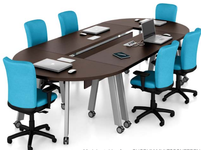
Modular tables from QUORUM MULTICONFERENCE in Dark Chocolate. Onyx seating by United Chair.