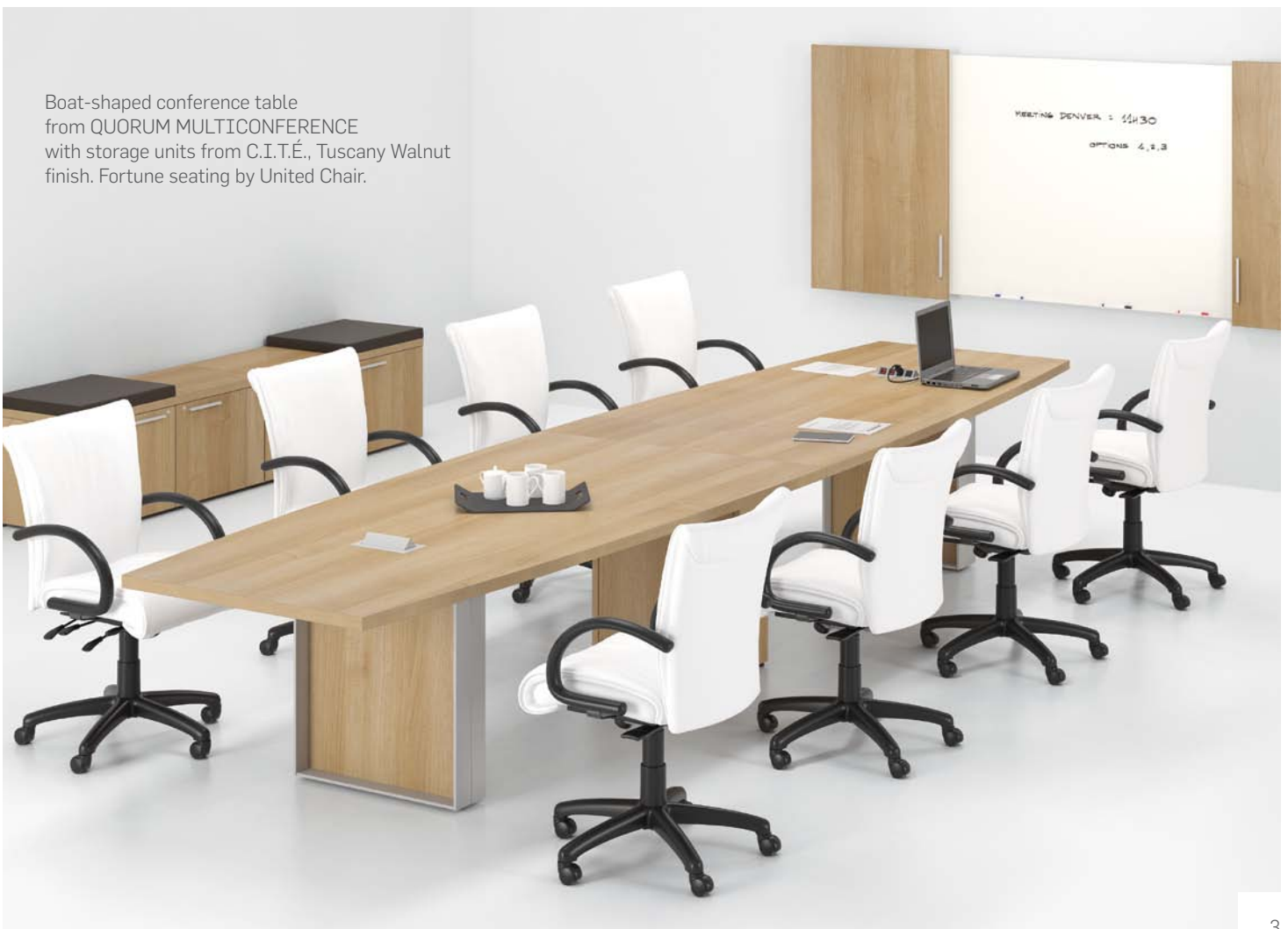
Boat-shaped conference table from QUORUM MULTICONFERENCE with storage units from C.I.T.É., Tuscany Walnut finish. Fortune seating by United Chair.