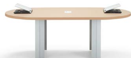
T52N-RC3684 GIN + TNNN-CB20