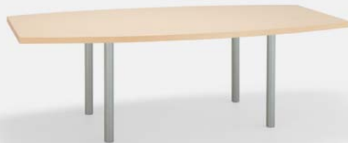
T5NN-B3684 GIN + TNNS-VTL2