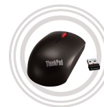
ThinkPad® Optical Wireless Mouse Mouse for All