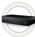
ThinkPad® USB 3.0 Ultra Dock Universal Docking Solution