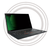
3M Privacy Filters from Lenovo™ Privacy Protection & Anti-Glare