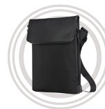
ThinkPad® Ultra Messenger Function, Protection & Comfort