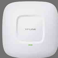
EAP225 EAP220 EAP120 EAP115 EAP110