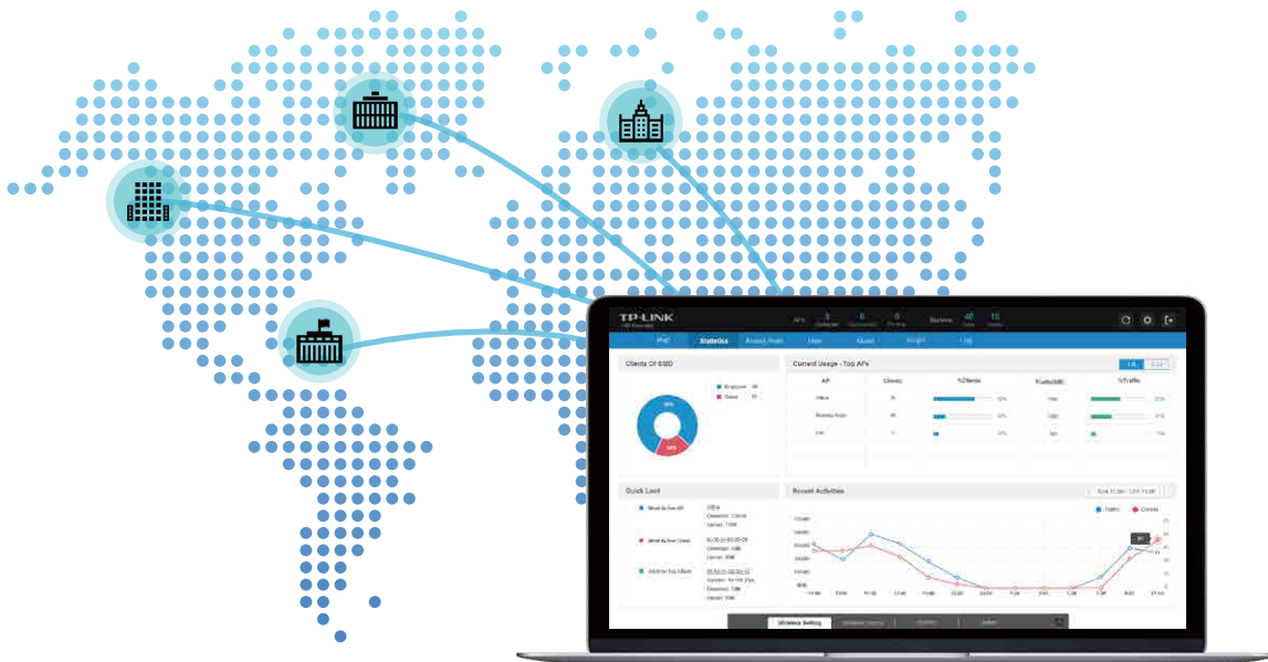
EAP Controller Software