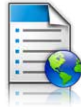
Forms and Favorites

Display Customization: Display a customized, scrolling slideshow on the color touch screen to communicate important messages to users while the printer is in sleep mode.