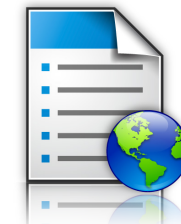
Forms and Favourites