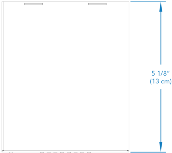
EXB-IRS4 (Top View)