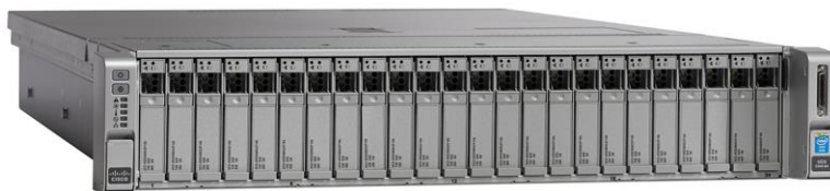
Figure 1. Cisco UCS C240 M4 Rack Server

The Cisco UCS ® C240 M4 Rack Server is our newest 2-socket, 2-rack-unit (2RU) rack server (Figure 1.) It offers outstanding performance and expandability for a wide range of storage and I/O-intensive infrastructure workloads, from big data to collaboration. The enterprise-class Cisco UCS C240 M4 server extends the capabilities of the Cisco Unified Computing System ™ (Cisco UCS) portfolio in a 2RU form factor with the addition of the Intel ® Xeon ® processor E5-2600 v3 product family, which delivers a superb combination of performance, flexibility, and efficiency.