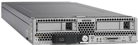
Figure 1. Cisco UCS B200 M4 Blade Server

In addition, Cisco UCS has the architectural advantage of not having to power and cool excess switches, NICs and HBAs in each blade server chassis. Having a larger power budget per blade server provides uncompromised expandability and capabilities, as in the new Cisco UCS B200 M4 server with its leading memory-slot and drive capacity.