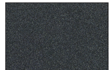
4623 - Graphite Nebula