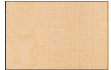
7909 - Fusion Maple