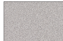
4622 - Gray Nebula