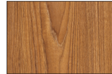
7209 - Nepal Teak