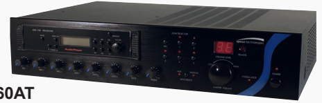
PBM60AT PBM120AT PBM240AT