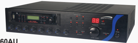
PBM60AU PBM120AU PBM240AU