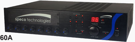
PBM60A PBM120A PBM240A