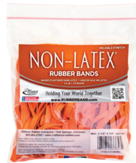
1/4 LB POLY BAG