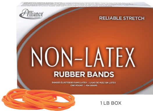
1 LB BOX