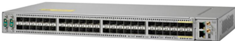
Figure 1. Cisco ASR 9000v

Deployed adjacent to, or remotely from, its Cisco ASR 9000 Series host, the environmentally hardened, front-access, low-power, ultra-compact Cisco ASR 9000v and ASR 9000v-V2 delivers ASR 9000 Series services and scale at locations that are otherwise unachievable by either an access system or an edge system. Because the nV technology extends the Cisco ASR 9000 Series control plane and management interface over a fabric port that incorporates the Cisco ASR 9000v and Cisco ASR 9000v-V2 as a component of the Cisco ASR 9000 Series host, installation, turn-up, Element Management System (EMS) and Network Management System (NMS) integration, and service activation can be accomplished in a matter of minutes (Figure 1).