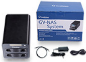
GV-NAS System Single Package

You can choose to purchase a GV-NAS System package or a bundled package which also includes 4 GV-Target IP Camera of your choice and a GV-PoE switch. For more details, please see the " Packing List " tab.