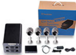
Bundled Package for GV-NAS2008