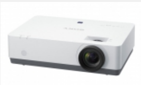
VPL-EX310 3,800 lumens XGA high brightness compact projector