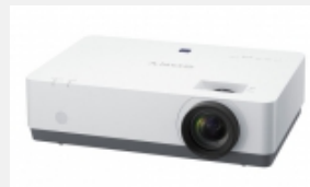
VPL-EX345 4,200 lumens XGA high brightness compact projector