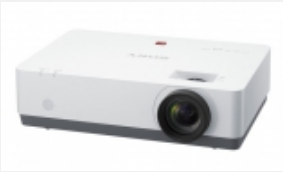
VPL-EW345 4,200 lumens WXGA high brightness compact projector