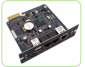
Network Management Card