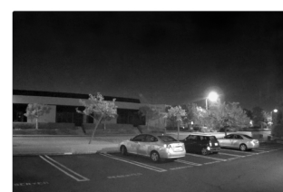
30 M Night Vision