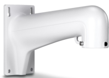
Wall Mount TV-HW400