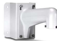
Corner Mount TV-HN400