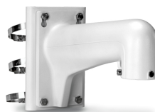
Pole Mount TV-HP400