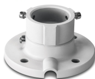
Ceiling Mount TV-HC400