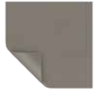
Da-Tex Half Angle: 30° Gain: 1.3