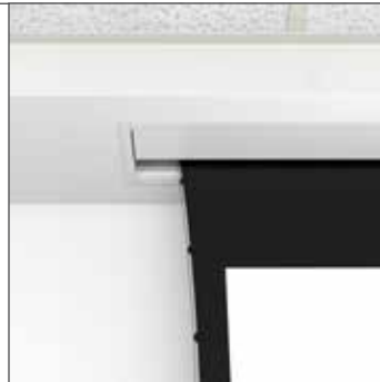
In Ceiling (Open)