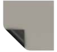
High Contrast Da-Mat Half Angle: 45° Gain: 0.8