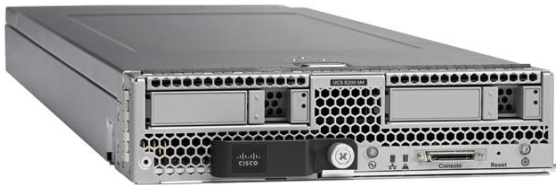
Figure 1. Cisco UCS B200 M4 Blade Server

In addition, Cisco UCS has the architectural advantage of not having to power and cool excess switches, NICs and HBAs in each blade server chassis. Having a larger power budget per blade server provides uncompromised expandability and capabilities, as in the new Cisco UCS B200 M4 server with its leading memory-slot and drive capacity.