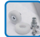
Ball Bearing Rollers