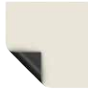
Da-Mat Half Angle: 60° Gain: 1.0