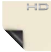
HD Progressive 1.1 Half Angle: 85° Gain: 1.1