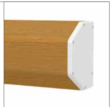
Light Veneer Case