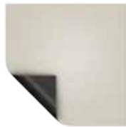
High Contrast Cinema Vision Half Angle: 50° Gain: 1.1