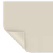
Dual Vision Half Angle: 65° Gain: 0.9