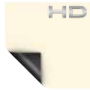
HD Progressive 1.3 Half Angle: 75° Gain: 1.3