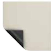
Pearlescent Half Angle: 40° Gain: 1.5