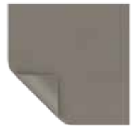
Da-Tex Half Angle: 30° Gain: 1.3