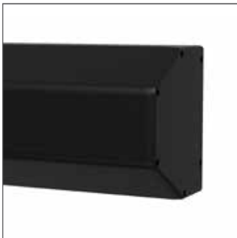
Black Case (Standard)