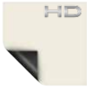
HD Progressive 0.9 Half Angle: 85° Gain: 0.9