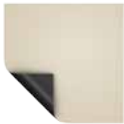
Cinema Vision Half Angle: 45° Gain: 1.3