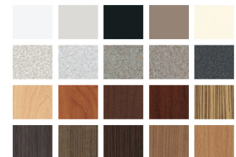
(20+) STANDARD LAMINATES