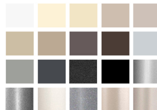
(20) STANDARD POWDER COAT FINSHES