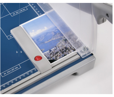
This Dahle trimmer features a manual clamp with built-in finger protection.