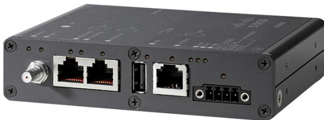
Figure 1. Cisco IR500

Figure 1 displays a Cisco WPAN Industrial Router.