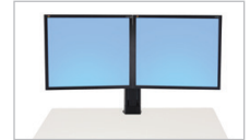
Dual Monitor Kit 97-904 (black)