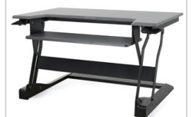
WorkFit-T Sit-Stand Desktop Workstation