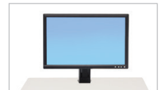
Single HD Monitor Kit 97-906 (black)