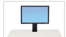
Single LD Monitor Kit 97-905 (black)