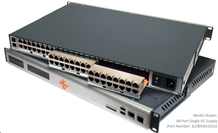
Model shown: 48-Port Single AC Supply (Part Number: SLC804812015)

The Lantronix ® SLC ™ 8000 advanced console manager is the industry's first modular console server that provides secure remote access to IT equipment, while reducing deployment costs and time.