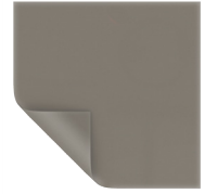
High Contrast Da-Tex