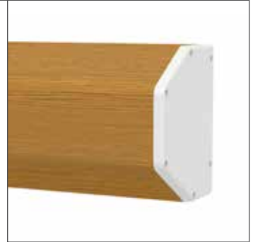
Light Veneer Case