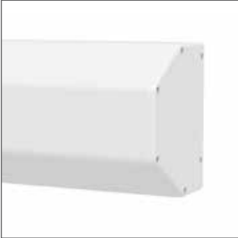
White Case (Standard)