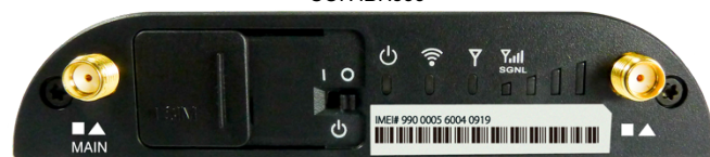
SIM SLOT / ON-OFF / LEDs / SIGNAL STRENGTH COR IBR600