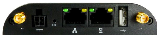
POWER / RESET / LAN / WAN / USB COR IBR600

*WiFi is only supported on IBR600 models.