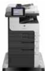
HP LaserJet Enterprise MFP M725f