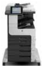
HP LaserJet Enterprise MFP M725z