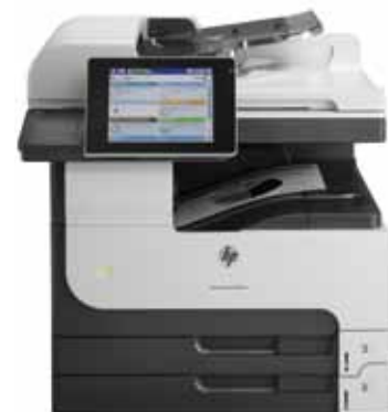
(HP LaserJet Enterprise MFP M725dn shown)

Mobile printing capability: HP ePrint, Apple AirPrint™