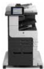
HP LaserJet Enterprise MFP M725z+