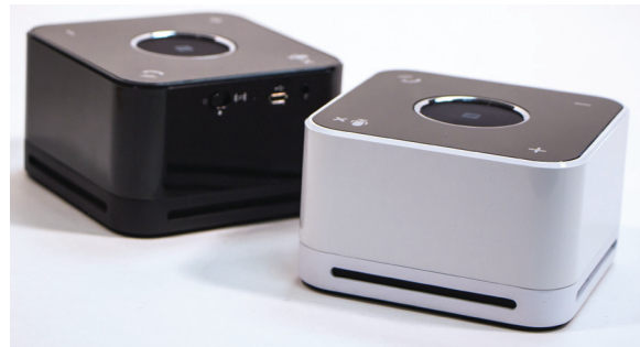
Your choice of Marble White (MCP-3020) or Obsidian Black (MCP-3022)