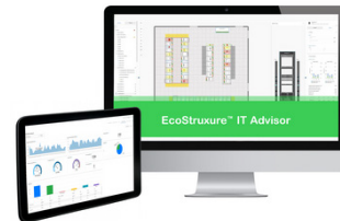
EcoStruxure IT Advisor