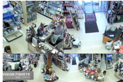
Dewarped Image: 2 PTZ views & 1 360 degree view