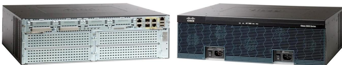
Figure 1. Cisco 3900 Series Integrated Services Routers

Cisco® 3900 Series Integrated Services Routers build on 25 years of Cisco innovation and product leadership. The new Cisco Integrated Services Routers Generation 2 (ISR G2) platforms are architected to enable the next phase of branch-office evolution, providing rich-media collaboration and virtualization to the branch office while maximizing operational cost savings. The new routers support new high-capacity digital signal processors (DSPs) for future enhanced video capabilities, high-powered service modules with improved availability, multicore CPUs, Gigabit Ethernet switching with Cisco Enhanced Power over Ethernet (ePoE), and new energy visibility and control capabilities while enhancing overall system performance. Additionally, a new Cisco IOS® Software Universal image and Cisco Services Ready Engine (SRE)® module enable you to decouple the deployment of hardware and software, providing a flexible technology foundation that can quickly adapt to evolving network requirements. Overall, the Cisco 3900 Series offers exceptional total cost of ownership (TCO) savings and network agility through the intelligent integration of market-leading security, unified communications, wireless, and application services.