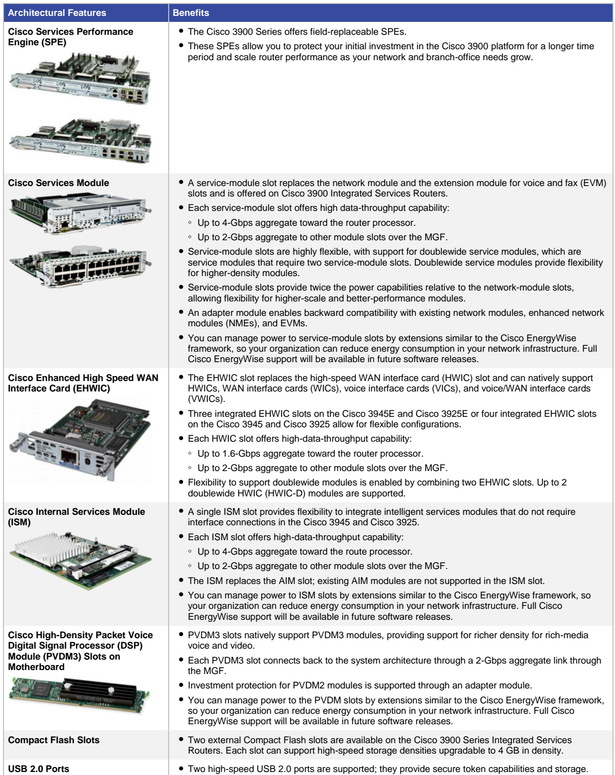
Table 3. Modularity Features and Benefits