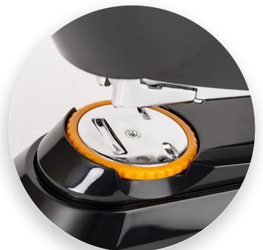
Adjustable anvil rotates for more stapling options.