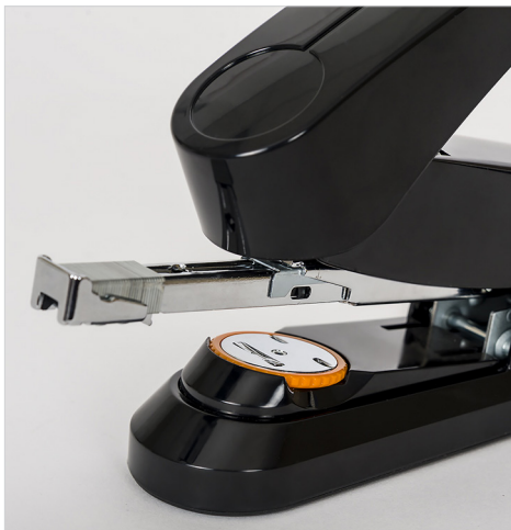
Steel components offer durability and smooth stapling.

Increase leverage and power with the innovative hinged handle to staple up to 50 sheets with 70% less effort.