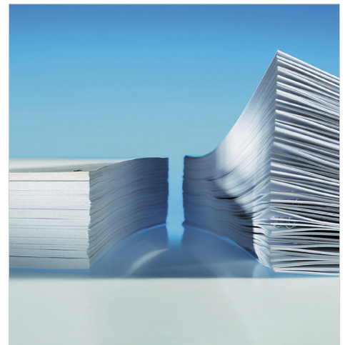
Flat clinch stapling takes up 30% less filing and binder space.