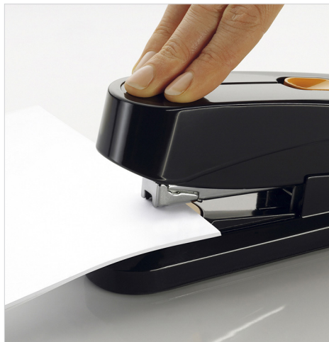
Dual staple guide reduces jams and ensures even clinches.