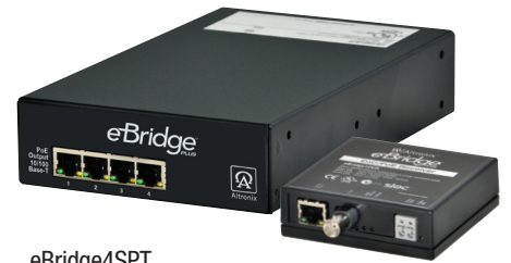
eBridge4SPT and eBridge100SPR

Altronix eBridge4SK kit consists of eBridge100SPR and eBridge4SPT Coax to CAT-5 Ethernet adapters/media converters that deliver data and power over coax cable. The paired set enables fast 10/100 Base-T Ethernet digital communication. eBridge4SPT allows to upgrade the existing infrastructure by replacing a single analog device with up to four (4) PoE/PoE+ devices. eBridge100SPR passes data and sends power over the coax to the eBridge4SPT. Data transmission and power over the Coax are possible up to 300m. Maximum range from headend to the PoE camera/device is 500m, taking into consideration that up to 100m of structured cable may be deployed at each end. eBridge4SK enables cost-effective system upgrades and eliminates the costs and labor associated with installing new network cabling.