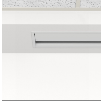
In Ceiling (Closed)