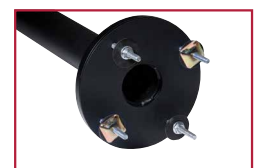
Slope nut security (shown without desktop surface)