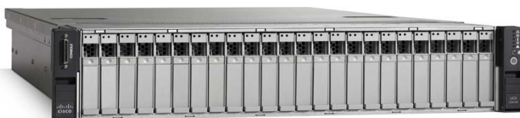
Figure 1. Cisco UCS C240 M3 Server

The Cisco UCS C240 M3 interfaces with Cisco UCS using another Cisco innovation, the Cisco UCS Virtual Interface Card (VIC 1225). The Cisco UCS Virtual Interface Card (VIC 1225) is a virtualization-optimized Fibre Channel over Ethernet (FCoE) PCI Express (PCIe) 2.0 x8 10-Gbps adapter designed for use with Cisco UCS C-Series Rack Servers. The VIC is a dual-port 10 Gigabit Ethernet PCIe adapter that can support up to 256 PCIe standards-compliant virtual interfaces, which can be dynamically configured so that both their interface type (network interface card [NIC] or host bus adapter [HBA]) and identity (MAC address and worldwide name [WWN]) are established using just-in-time provisioning. In addition, the Cisco UCS VIC 1225 can support network interface virtualization and Cisco® Data Center Virtual Machine Fabric Extender (VM-FEX) technology.